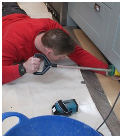
Any work carried out, such as proofing, must be documented in your report.

This is commonly referred to as a 'treatment report'.