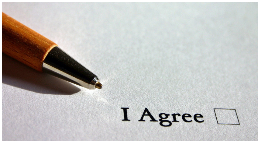
Reports must have a customer signature or electronic confirmation, which shows they have read and understood the treatment report.

The following items are those that must always be carried out and followed as a BPCA member, whether it is in handwritten or electronic format.